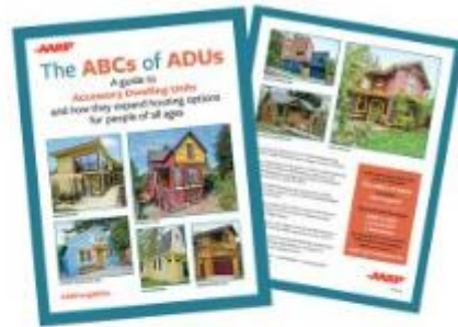
Accessory Dwelling Units The ABCs of ADUs: An Introductory Guide (D20473) Accessory Dwelling Units: An Advanced Guide (D20480)