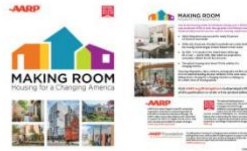
Make Room for Making Room Making Room: Housing for a Changing America (D20459)