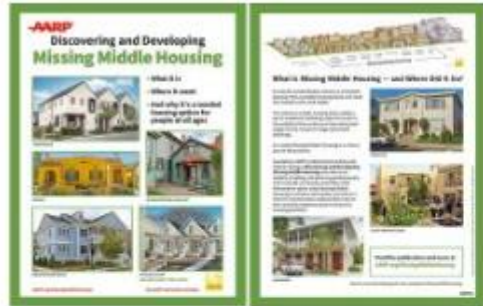
Missing Middle Housing Discovering and Developing Missing Middle Housing (D20791)