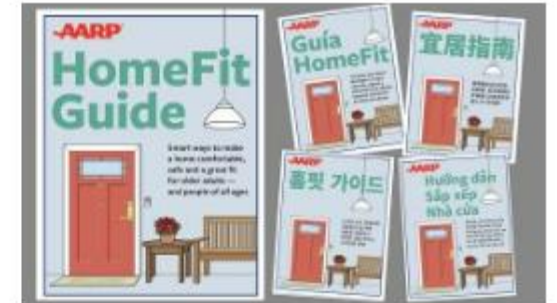
AARP HomeFit AARP HomeFit Guide (English, D18959) (Spanish, D20606), (Chinese, D20608) (Korean, D20607) (Vietnamese, D20609)

https://www.aarp.org/livable-communities/tool-kits-resources/library/