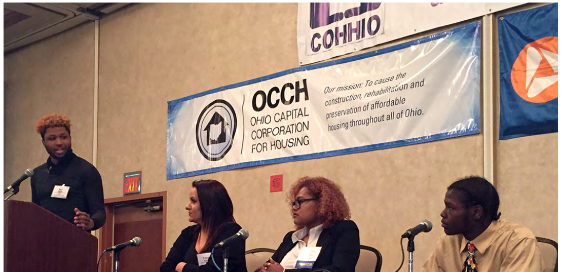
Clockwise: Exhibit traffic at the Sheraton; The Commons in Harmony choir; Members of the Lighthouse Youth Advisory Committee; Matthew Desmond, author of "Evicted"